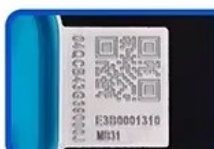
COMPLETE QR CODE