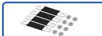
FREE BUS BARS AND GRUB SCREW&NUT