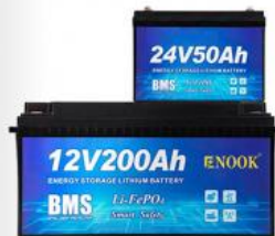
12V & 24V SERIES ENERGY STORAGE LITHIUM BATTERY