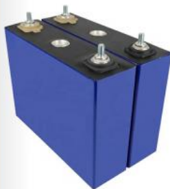
Lifepo4 battery 3.2V 304A