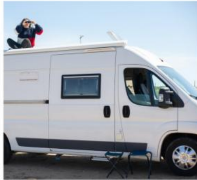
RV energy storage