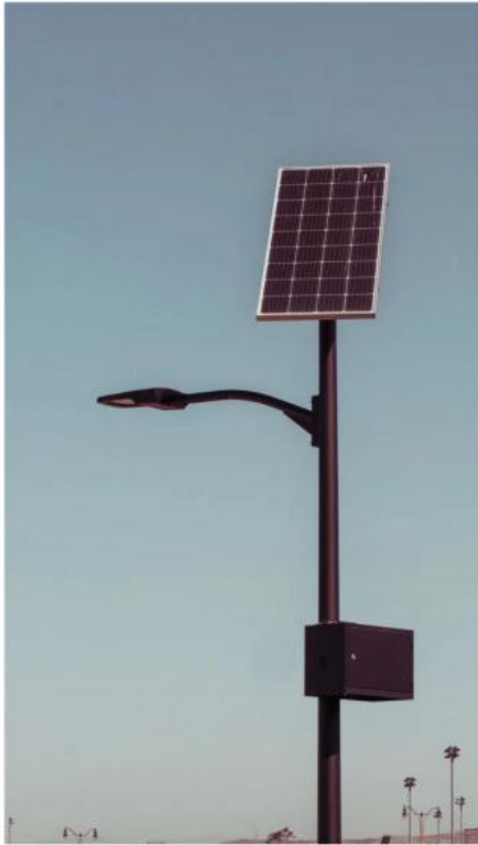
Solar street lamp