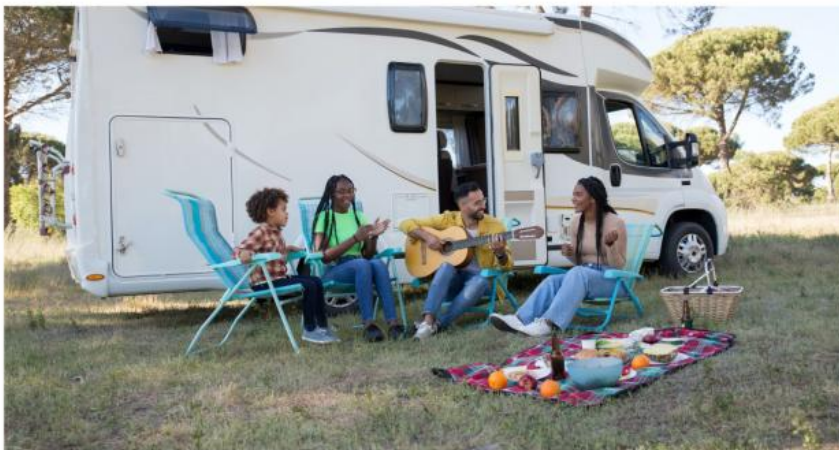
Backup power for outdoor camping